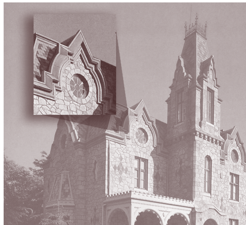
Mansion's Iconic Cornices