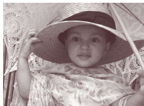
Guests dressed in Victorian costumes for photos at the Old Fashioned Picnic

The 2010 Old Fashioned Picnic attracted 94 visitors from the Tulpehocken community, Philadelphia and New Jersey. Participants enjoyed old fashioned games—ring toss, croquet, scavenger hunts and dressing in Victorian costumes for photographs. For the first time